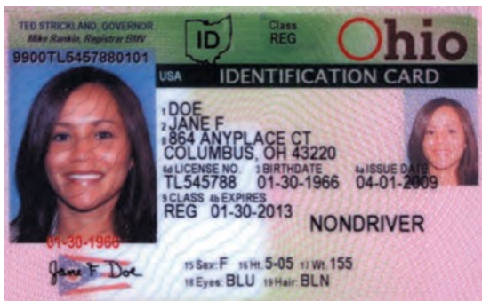
State Identification Card